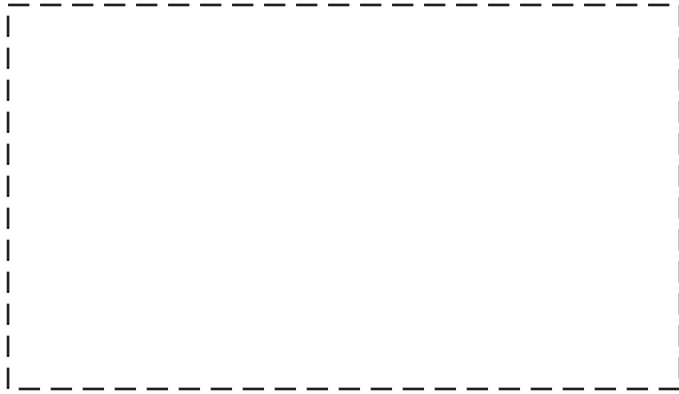
3-1/2" x 2" DEBOSS