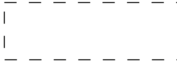
3 x 1 Top & Bottom