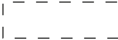
2 x .625 Front & Back (Above & Below)