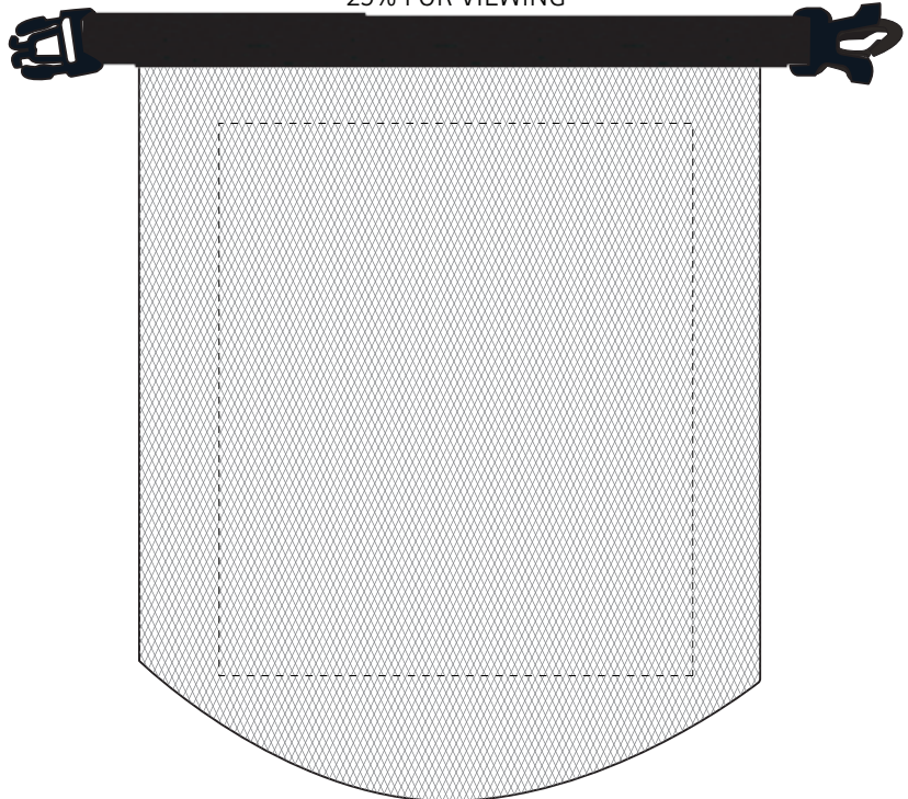
5-Liter Waterproof Gear Bag With Touch-Thru Pouch WBA-WB20 - BACK (Black) 25% FOR VIEWING

Please Note: The logo may not display completely when rolled