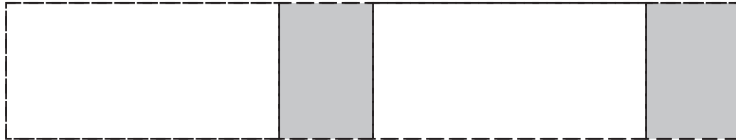
2-Sided Wrap (SCREEN) One Color Only (DIGITAL) or (LASER ENGRAVE)