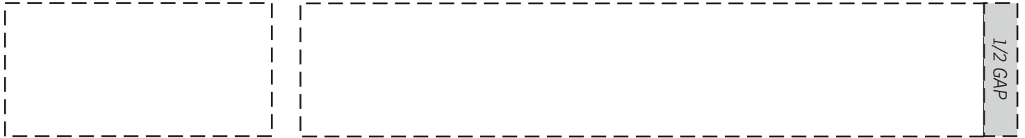
4" x 2" (SCREEN) One Color Only (DIGITAL) or (LASER ENGRAVE)