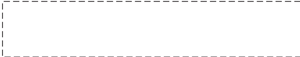
10-5/8" x 2" Seamless Wrap (DIGITAL)