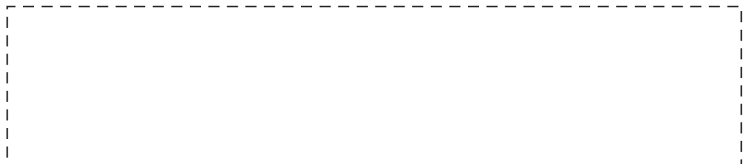
11" x 2-3/8" Seamless Wrap (DIGITAL)