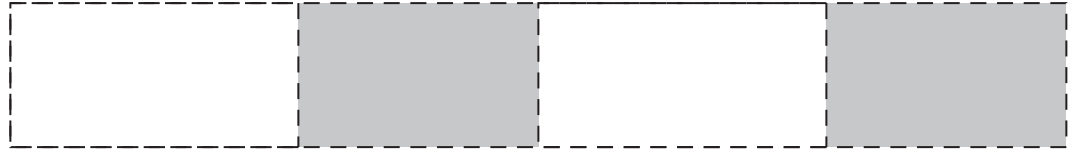
2-Sided Wrap (SCREEN) One Color Only