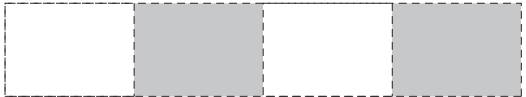
2-Sided Wrap (DIGITAL or LASER ENGRAVE)